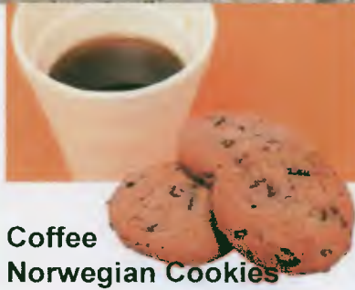
Coffee Norwegian Cookies