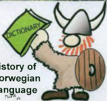
History of Norwegian Language