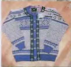
Bunad & sweaters